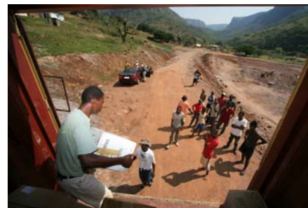
Unloading Books in Lower Molweni Kwazulu Natal