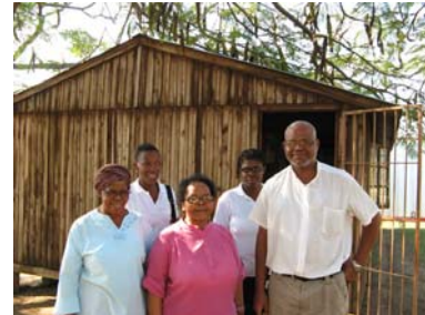
Home Caregivers in Front of Ekuvukeni Primary Healthcare Center