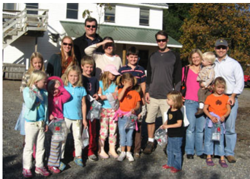
Epiphany families enjoy a sunny Fall day picking apples with Brookview House @ Honey Pot Hill