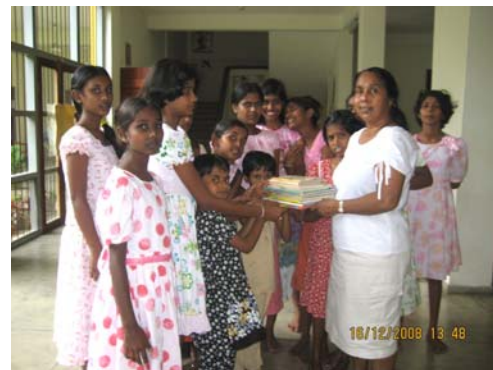
Students receiving books in Sri Lanka on Dec 16, 2008