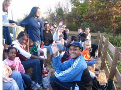
Epiphany families join Brookview house families on a hay ride out to the apple orchard.

This year's apple picking was enjoyed by 5 Epiphany families and over 80 members of Brookview House. Though the apples were not as abundant as other years, Honey Pot Hill set aside special rows of empire and delicious apples for the entire group which we arrived at via hayride guaranteeing everyone a bag full of apples. This year was a particularly friendly gathering as both Epiphany and Brookview families could join together on the hayride providing a better opportunity to enjoy each other's company.