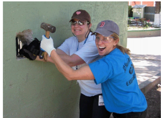
Sledgehammering concrete walls to make openings for windows