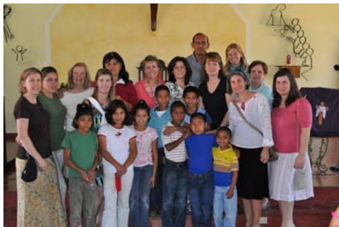
Team with kids @ church in Tegucigalpa

To read more about their trip go to their blog @ http://www.weelhogar.blogspot.com .