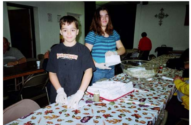
Setting up for the meal