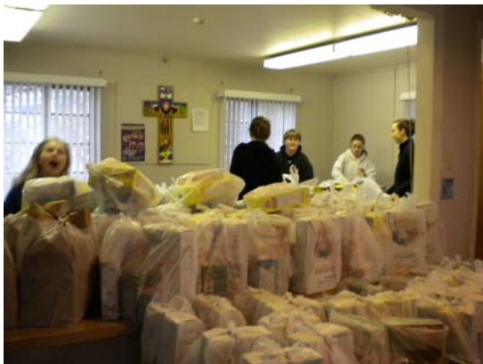
Bags of breakfast meals