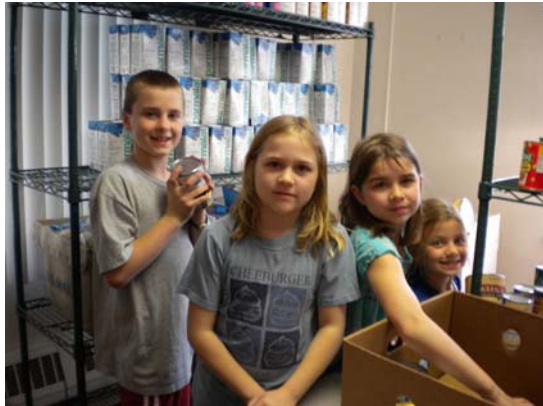
Organizing cans and meals in the pantry