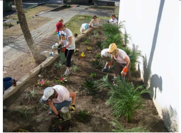
Garden project #2