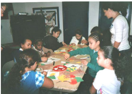
St. Stephens's students working on a turkey craft

Thank you to all our volunteers who donated food, helped deliver, cook and serve the meal and to all our volunteers who helped with arts and crafts and games. We played games, made crafts, bagged over 150 turkeys and fed close to 200 people in a tiny space! For St. Stephens church, this is their favorite celebration from a staff, kid and family viewpoint. 25 Epiphany families provided the food and 15 parishioners helped on site.